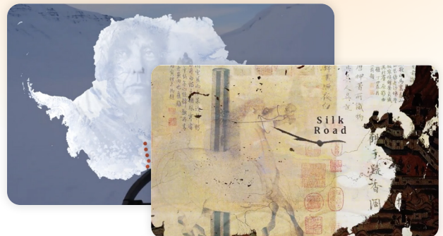
● (Upper left) Roald Amundsen’s polar party reached the South Pole. (Bottom right) economic changes from the Silk Road.

Human Geography is a one-year high school level course that takes a thematic approach to the study of all aspects of the field of human geography, including human-environment interaction; cultural, political, and economic geography; and globalization and the interconnectivity of the world’s people and places. This is our first course authored entirely in Imagine EdgeEX!