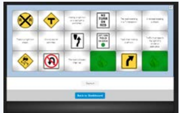
Driver's Ed Online Courses

Course materials are accessible through a third-party, user-friendly LMS and on all devices. Course progress is automatically saved so students can pick up right where they left off. Once they've finished the course, students can take their final test online, and after passing it, will earn their Certificate of Completion from an appropriately licensed school.