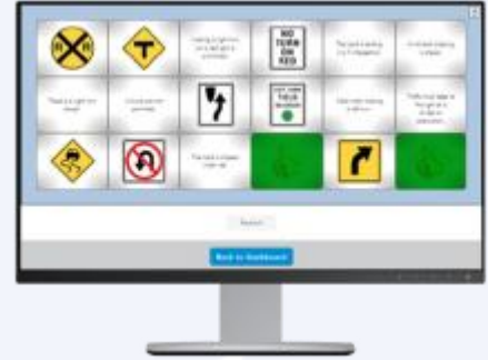
Driver's Ed Online Courses

Course materials are accessible through a third-party, user-friendly LMS and on all devices. Course progress is automatically saved so students can pick up right where they left off. Once they've finished the course, students can take their final test online, and after passing it, will earn their Certificate of Completion from an appropriately licensed school.